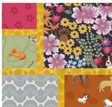
Block 1 A