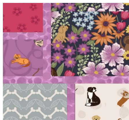
Block 2 A