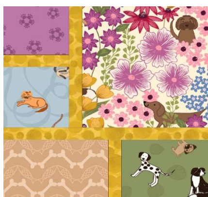
Block 2 A